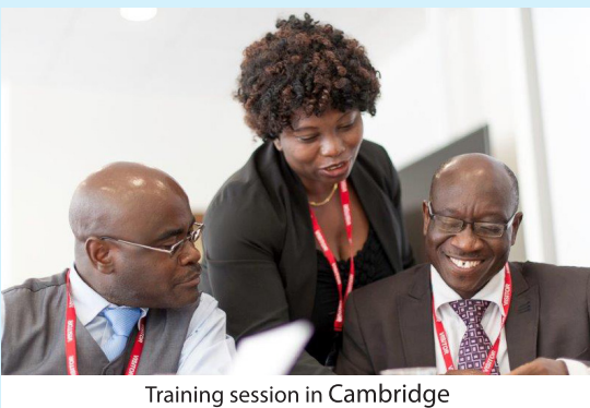
Training session in Cambridge

Some of the topics covered included; Principles of Assessment, Qualification Development; Principles and Practice of specification Design, Question paper Development, Using statistics in test construction and evaluation, Introduction to Rasch Measurement, Item Banking Demonstration, Expert Judgement in Standard Fixing, Grading & Grade review, Validity, Trends in Assessment worldwide; International benchmarking ( PISA, CEFR), Assessment for learning, E-assessment,