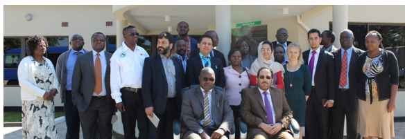
ECZ management and Afghanisthan Education officials pose for a photo