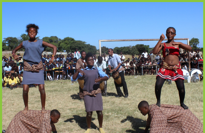
Pupils perform a traditional dance during the 2015 Careers Exhibition for Learners in Chilanga District