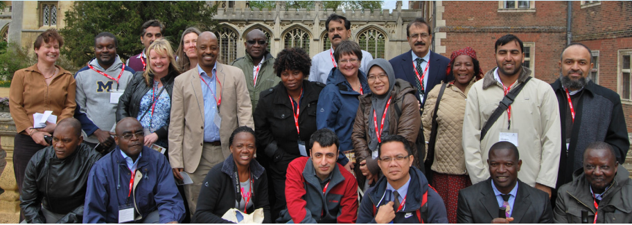
Participants at the 2015 Cambridge International Study Programme for Development and Administration of Public Examination in Cambridge, United Kingdom

The 2015 Cambridge International Study Programme for Development and Administration of Public Examination was held from the 11th to 22nd May, 2015 by Cambridge Assessment, Cambridge in the United Kingdom. This session was particularly important in that it was the tenth edition and Cambridge Assessment was celebrating its 10th anniversary. The course was attended by twenty five participants from Assessment organisations and ministry of Education from the following countries; Indonesia, Botswana, Namibia, Zambia, Ghana, Malaysia, South Africa, Lesotho, Pakistan, Oman, Armenia, Macedonia and Uganda.