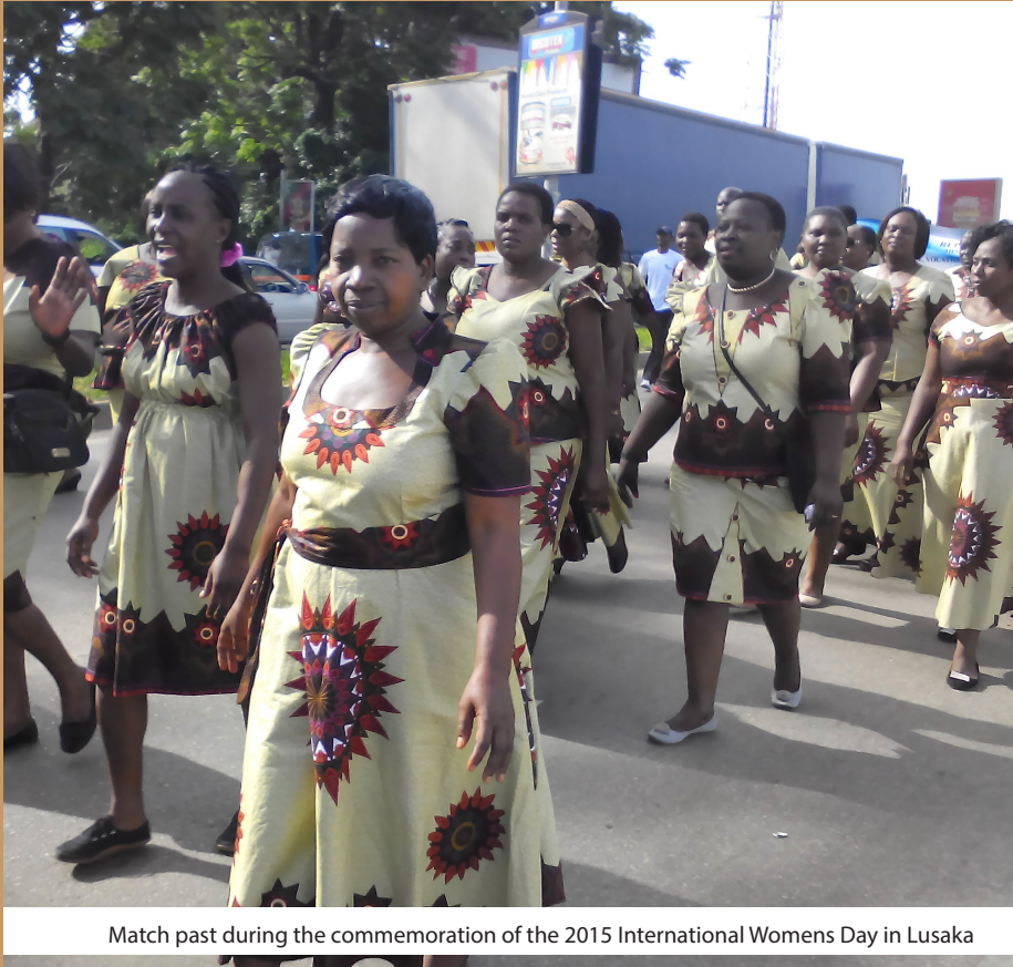
Match past during the commemoration of the 2015 International Womens Day in Lusaka

Sunday 8th March, 2015 was International Women's Day, a day designed to give women all around the world confidence and joy through the celebration of women and their achievements. The 2015 theme was, 'Gender is my agenda, make it happen.' It cannot be denied that the 2015 theme applied to Zambian women in a more touching way because at the moment, most women in Zambia are gaining momentum in holding positions of influence.