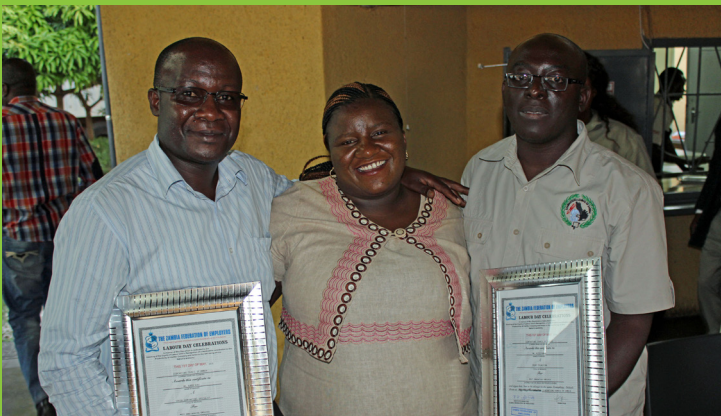
ECZ staff being rewarded for outstanding work performance during the 2015 Labour Day Awards Ceremony at ECZ