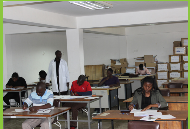
2015 Cambridge Examinations at ECZ