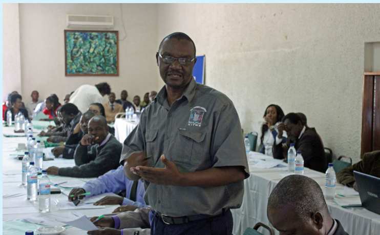
One of the participants making a proposal during the plenary session