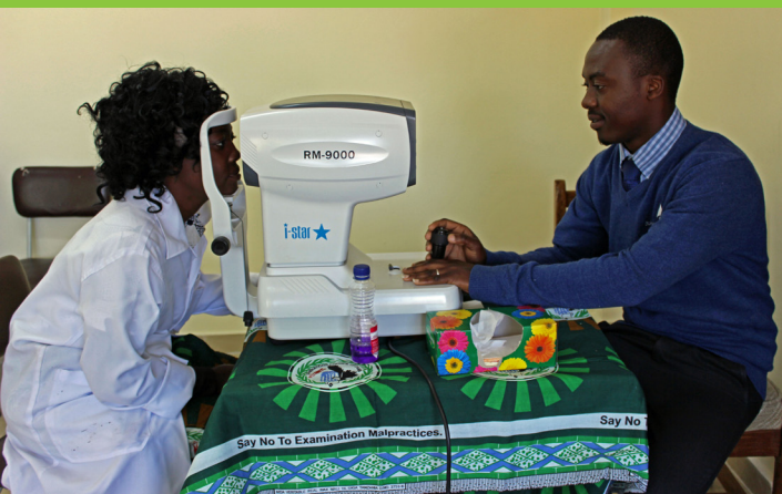
A member of staff (L) undergoing an eye screening process at ECZ