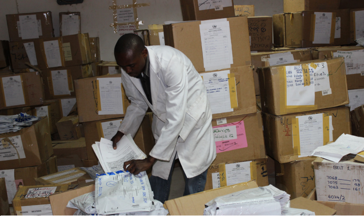
A member of staff resolving missing marks