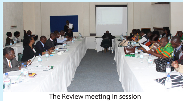
The Review meeting in session

A n annual review meeting is the key to staying on top of any organisation's activities and programmes. The result is that the organisation and its stakeholders stay in control of the activity implementation and keep its business constituents well informed and happy. It cannot be denied that yesterday's success for any organization does not ensure such in the future plans overtime. Hence, the need to review the activities and programmes periodically.