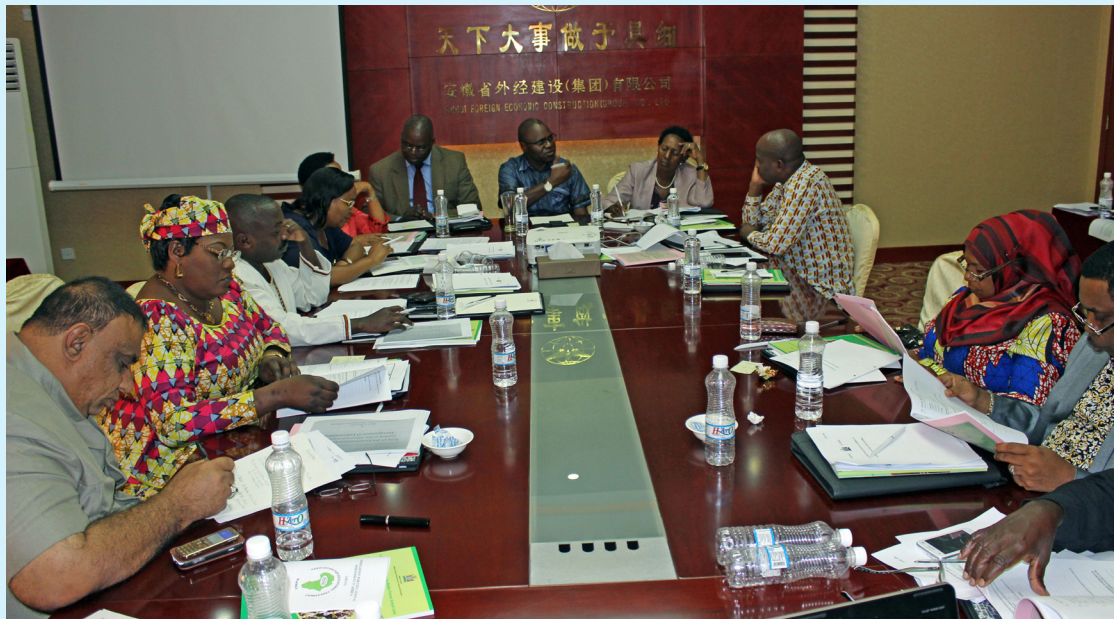
Consultative meeting between ECZ management and Tanzanian Members of Parliament in Lusaka