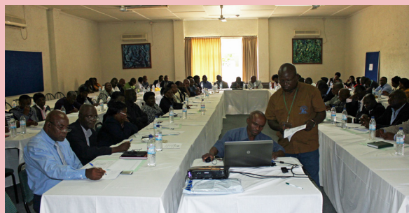
Chief Examiners workshop in Kabwe

The Chief Examiners resolved that the ECZ shall explore possibilities of including a