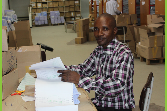
The packing of 2015 Examination Stationery at ECZ