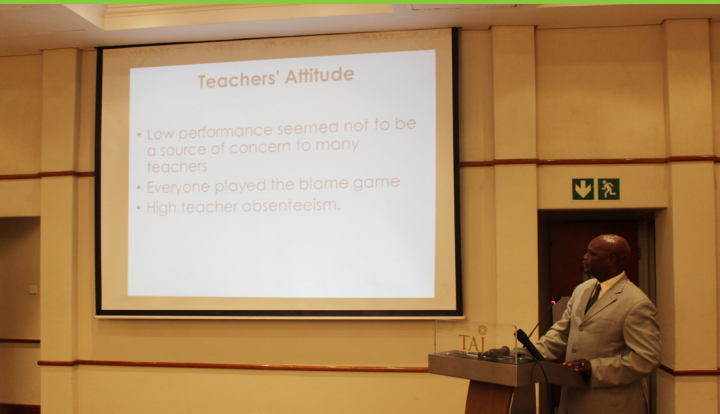
A presentation from Northwestern Province during the 2014 Performance Review Meeting in Lusaka