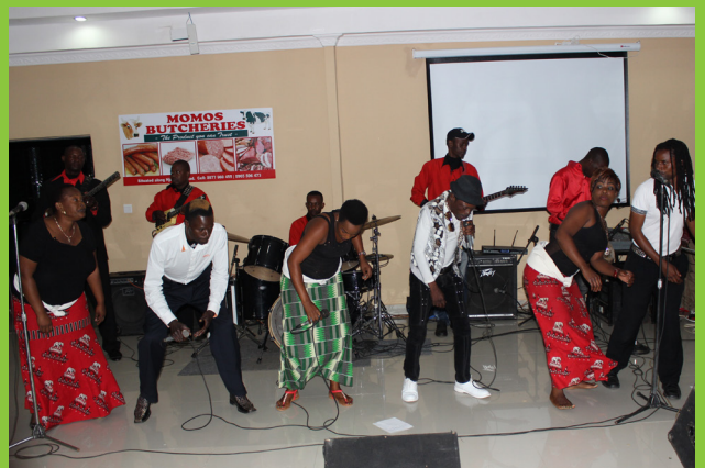
Amayenge entertain the delegates during the Kasisi Secondary School Fundraising Dinner in Lusaka