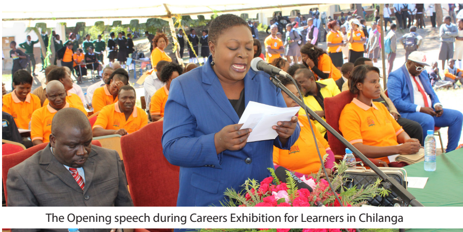
The Opening speech during Careers Exhibition for Learners in Chilanga

M aking career choices is not only a challenge for learners but for most people. In the case of learners in schools, this is compounded with the difficulty in identifying one's unique abilities and qualities as the process of self-discovery is never easy. Notwithstanding, career choices set the pace for one's future as choosing a right or wrong career may have a telling effect on an individual. Choosing a career is important to one's life as it determines who one becomes in the future.