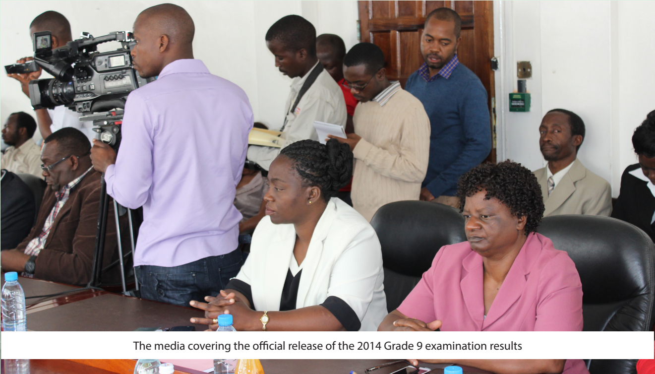
The media covering the official release of the 2014 Grade 9 examination results