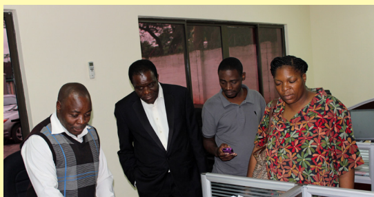
MNEB officials enquiring on the Online Query Tracking System at the ECZ Service Centre

One of the processes through which a company measures its products, services, and practices against its toughest competitors, or those companies recognized as leaders in its industry is through benchmarking.