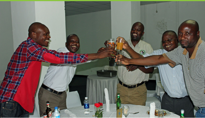
Members of staff during the 2014 End of Cycle Party at Mulungushi International Centre in Lusaka