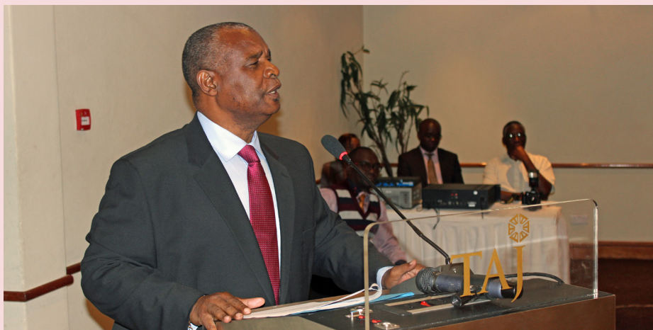
Honourable Minister of Education, Science, Vocational Training and Early Education- Dr Michael Kaingu delivering a speech during the meeting

In accordance with the Strategic Plan of 2009 to 2015, the ECZ successfully held the 3rd Annual Performance Review Meeting with all key stakeholders in the education sector, Cooperating partners and the Civil Society. The occasion was graced by the Honourable Minister of Education, Science, Vocational Training and Early Education (MESVTEE)- Dr. Michael Kaingu.