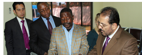
Afghanistan Education officials tour the ECZ Service Centre

In closing, the ECZ Director thanked all who were present and hoped the visit by Afghanistan officials marked the beginning of a long-lasting relationship with ECZ.