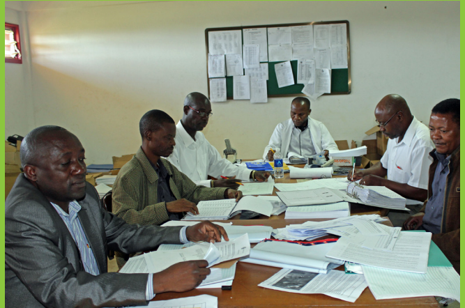
Verification of the 2015 Candidate Entries at ECZ