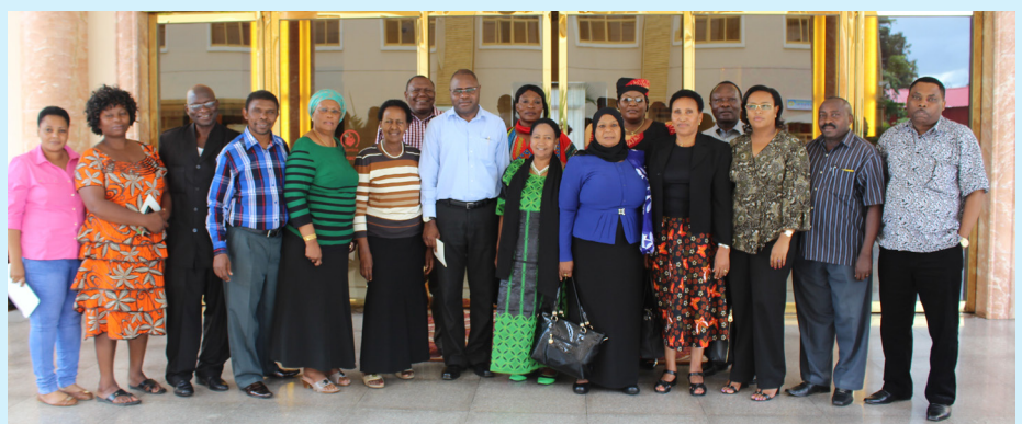
ECZ management and Tanzanian Members of Parliament pose for a photo

Through the benchmarking visit, we envisage that the Parliamentary Standing Committee on Social Services would determine what the best practice is, to prioritise opportunities for improvement, to enhance performance relative to public expectations, and to leapfrog the traditional cycle of change as they endeavoured to serve the interests of the citizens of Tanzania better.