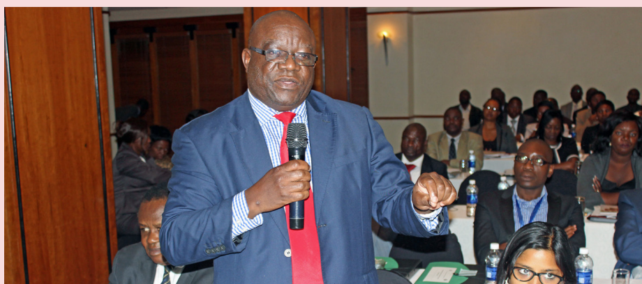
One of the participants during the 2014 Performance Review Meeting

In future reports, the ECZ will endeavor to include analysis of learner performance for candidates with Special Educational Needs.